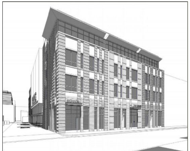
Proposed mixed-use development from S. Henry Street.