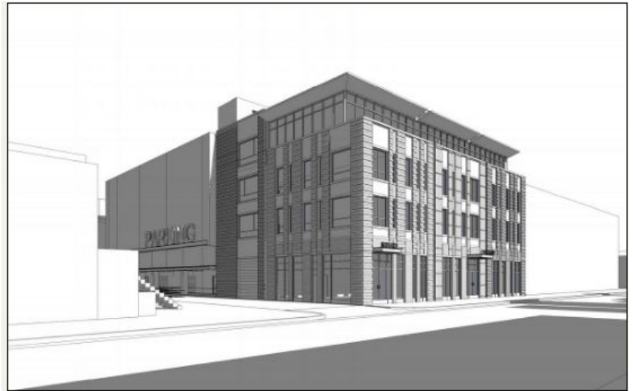
Proposed mixed-use development from corner of S. Henry Street

An automated parking garage between the two buildings would have two vehicle turntables upon entry, leading to over 140 spaces. The garage would serve the proposed buildings, as well as be available to the public.