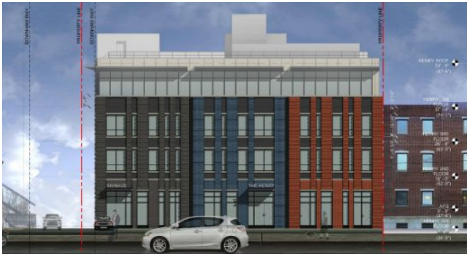
East elevation of proposed Henry Street building.