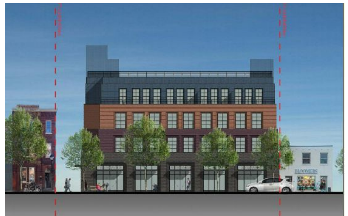
Elevation of option 4 for proposed King Street building.