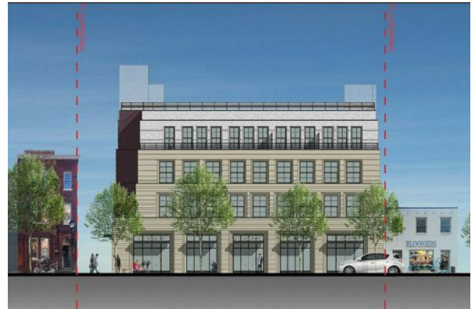
Elevation of option 2 for proposed King Street building.