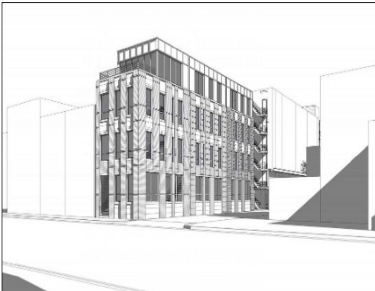
Proposed townhouse condos on S. Patrick Street.

The first component of the development would deliver a stacked pair of townhouse condos across four stories at 109 S. Patrick Street (map). The second component would deliver a four-story building at 116 S. Henry Street (map) with ground-floor retail, two ground-floor live/work units, and 17 additional residences.