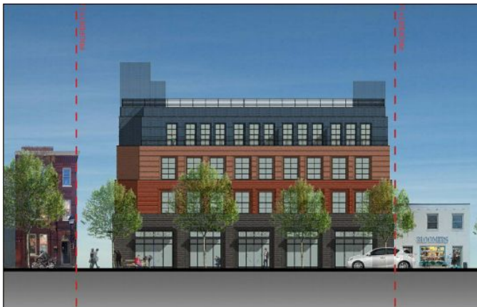
Elevation of option 3 for proposed King Street building.