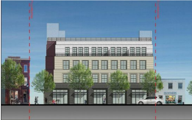
Elevation of option 1 for proposed King Street building.