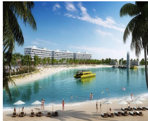
Set back from the beach will be hotels and residential units / Winstanley Architects & Planners