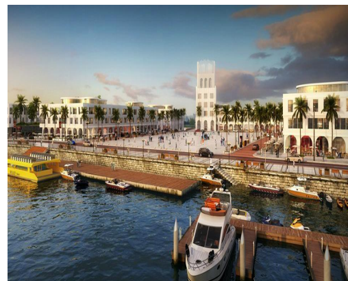
A canal extending away from the beach will be used as a fun and practical way for people to get around / Winstanley Architects & Planners