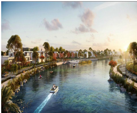
A canal extending away from the beach will be used as a fun and practical way for people to get around / Winstanley Architects & Planners